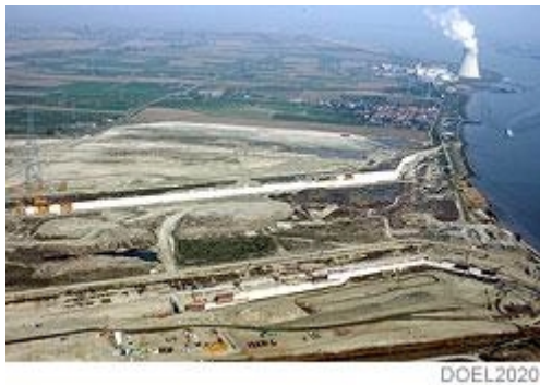
Doel, Belgium, located between a nuclear plant and docks, is the site of a planned port expansion.

At the heart of the scramble to build more port space is the world economy's increasing reliance on containers. These are 20- or 40-foot steel boxes that goods are packed into so they can be easily transferred within ports, then mounted on ships, trucks or trains. Containerized shipping requires deep-water docks, new infrastructure and more storage space.